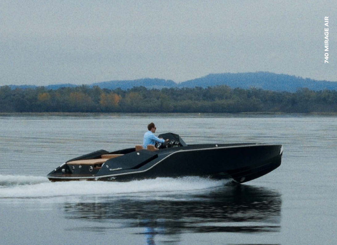
740 MIRAGE AIR