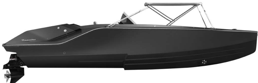
747 MIRAGE AIR