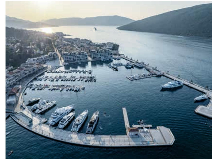
Portonovi Marina Herceg Novi / Montenegro Since 2020