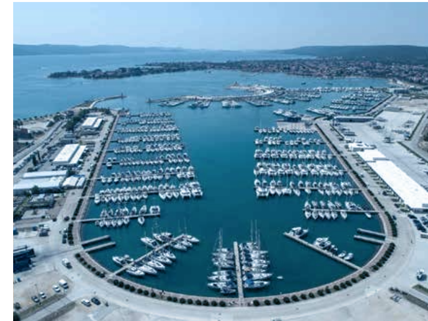
D-Marin Dalmacija Zadar / Croatia Since 2024